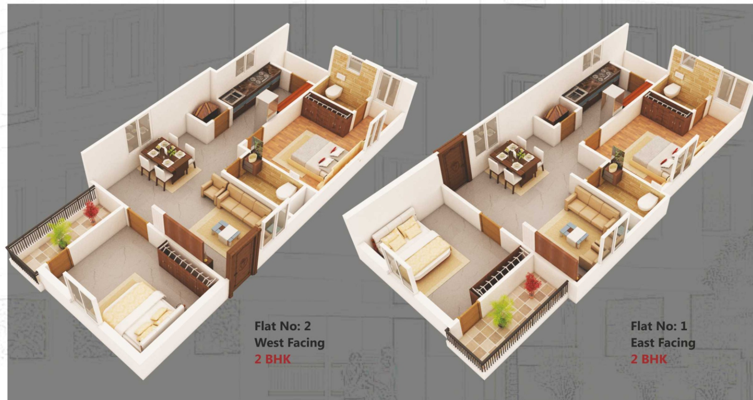
Flat No: 2 West Facing 2 BHK